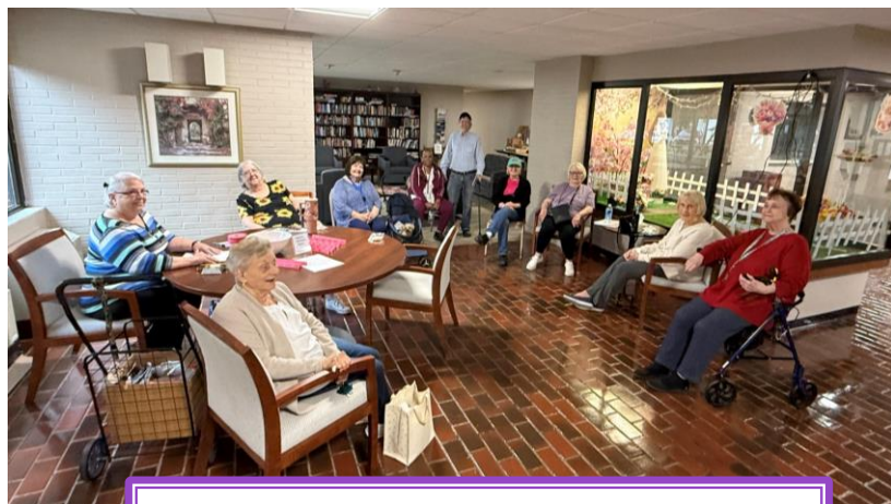
Awesome residents in the Lobby, chatting it up!

The City of Dearborn has changed the name of the building we play BINGO at every 3 rd Tuesday, from: Hubbard Manor to John B. O'Reilly, Jr. Manor