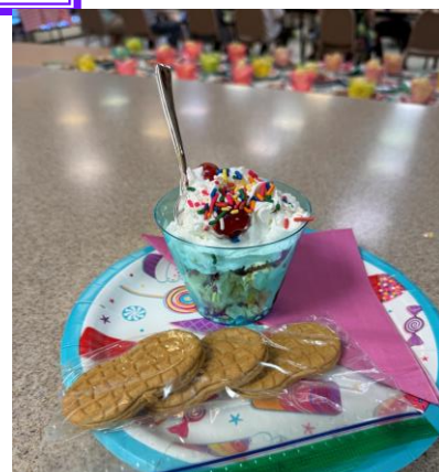
Ice Cream and Nutter Butters