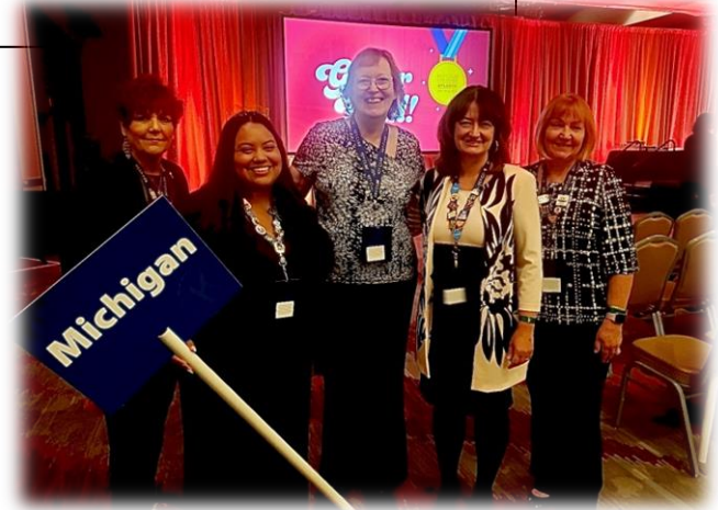
Key Club Convention in Atlanta. The Michigan adult Leadership and Chaperones, on DUTY! See it all in print Soon!