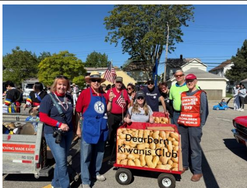
Kiwanians getting ready for the 1.5 mile hike down Michigan Avenue.